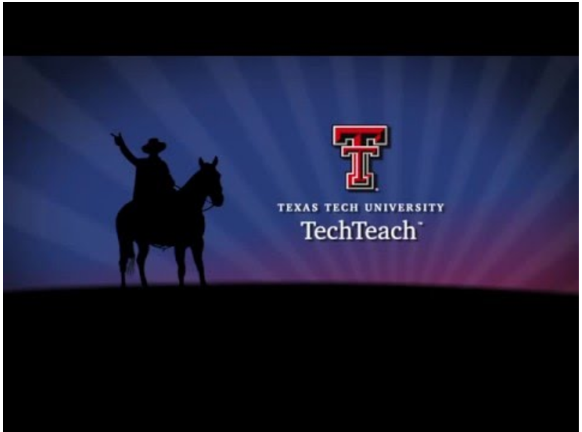
Video 1: TechTeach - Start a Revolution in Teacher Education